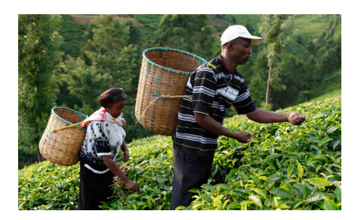
4. IFC She Works Final report, 2016

There are different moments when GBV incidents can occur at work, at home, but also on the way home or on the way to work. Within a plantation context, employee housing is often located within the estate setting. In such cases, GBV not only affects the work and productivity of employees, it affects their home lives as well. Evidence suggests that 68% of sexual harassment takes place at work<sup>4</sup>.